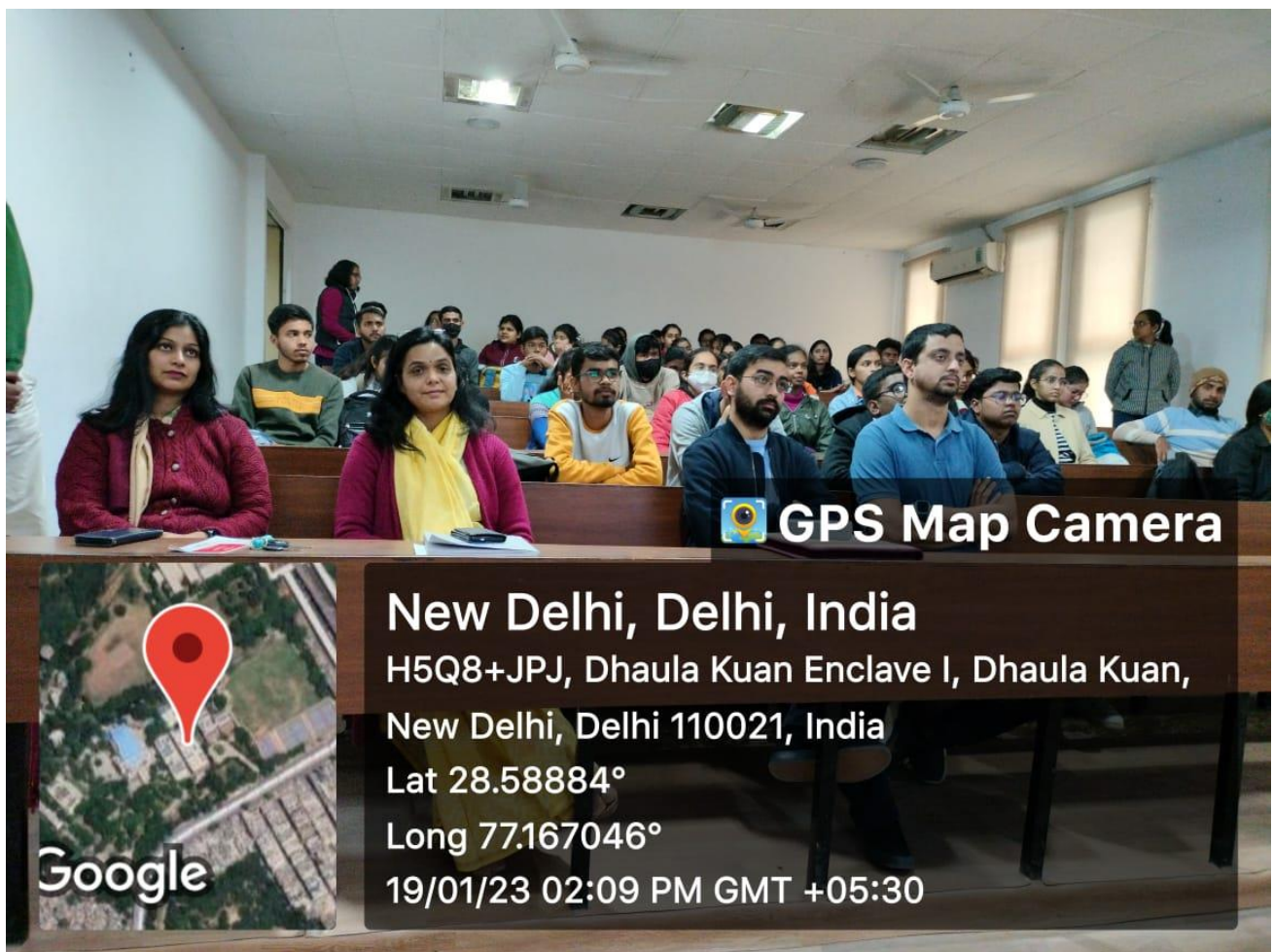
Students getting to know about the ECO CLUB

The event was taken forward by the Student Coordinators in helping the students know in depth about each and every thrust followed by a short video at the end of the description. The offline session was favoured by the audience. The event was thought-provoking and suitable considering the current situation. It was evident that the lecture piqued the audience's interest as many questions were raised at the end. The audience included college's experienced staff and inquisitive students.